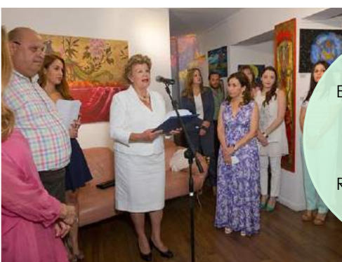
Exhibition opening, held by Mrs Andri Anastasiades, spouse of the President of the Republic of Cyprus