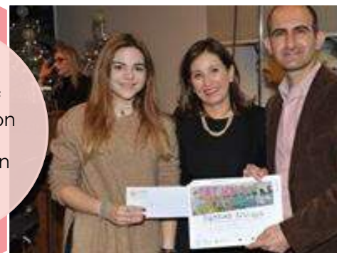
Award ceremony of the competition "The environment in our Hands"