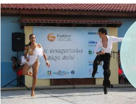
Cultural Festival, with participation of youth dance schools