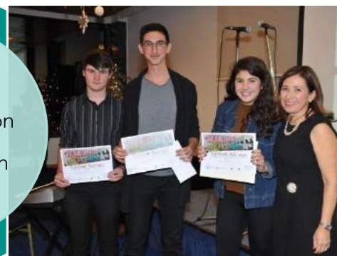
Award ceremony of the competition "The environment in our Hands"