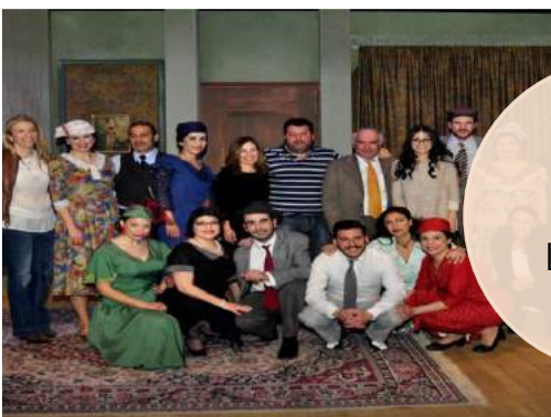
Theatre Play on Central Limassol scene