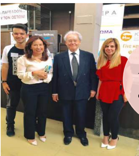
Exhibition of NGOs with the president of volunteer organisations of Cyprus